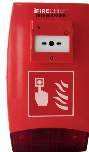
FIRECHIEF SITEWARDEN SE CALL POINT ALARM 116-1141