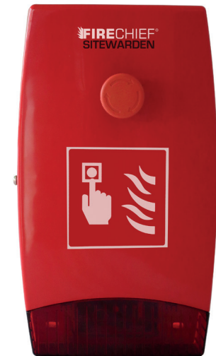
FIRECHIEF SITEWARDEN SE PUSH BUTTON ALARM 116-1142